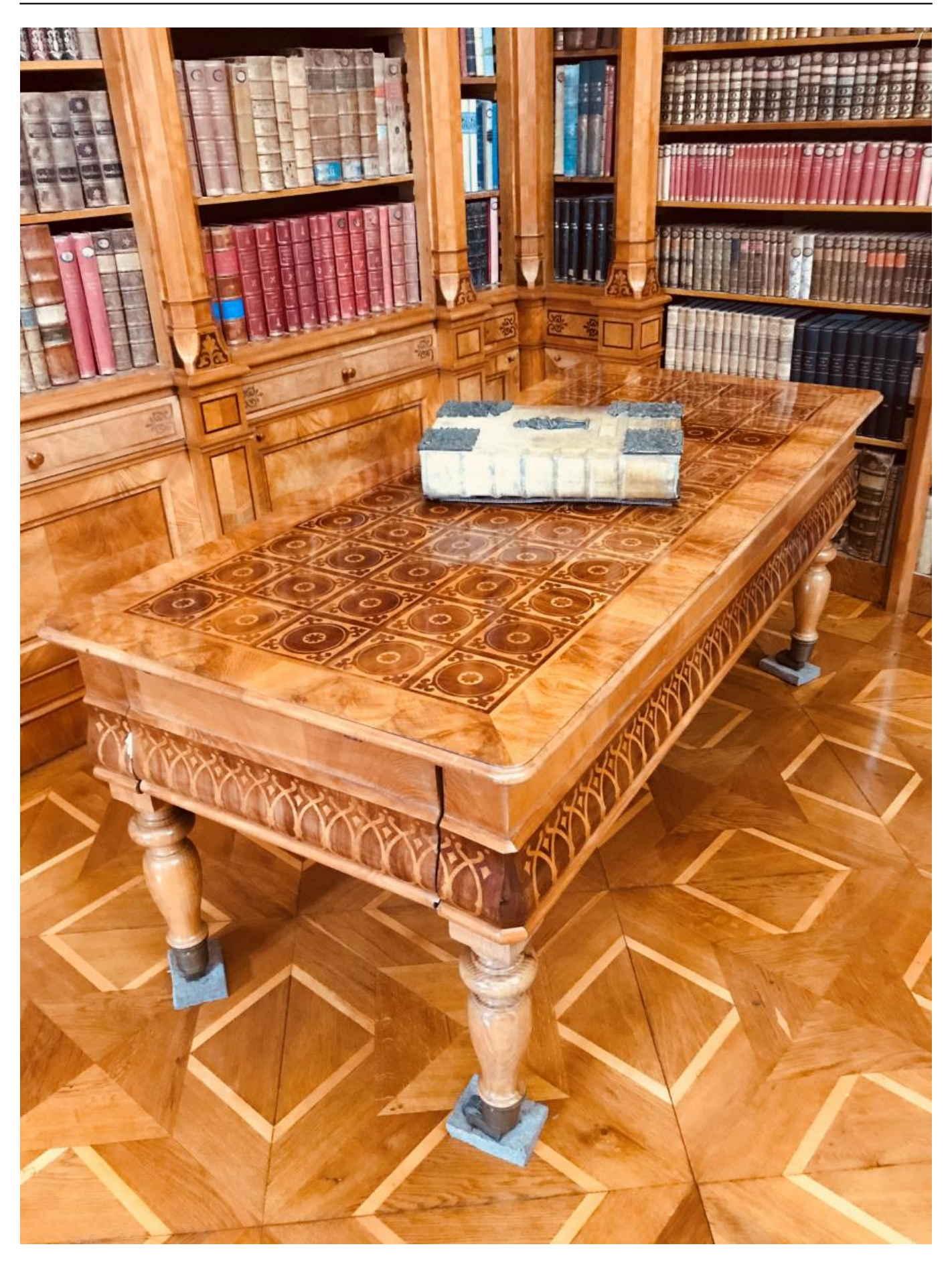
[6] Reading room of the Cistercian Historic Library of National Széchényi Library can also be visited by visitors and researchers as of June 23, 2020 .